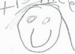
- Grade 1 Student

I look at things differently now that I have learned what a HERO and GEM is.