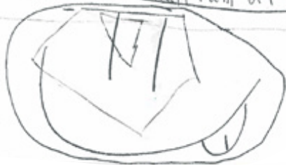
(I feel resilient when I am at school) - Grade 1 Student